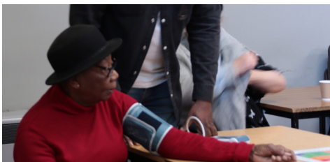
Blood pressure station